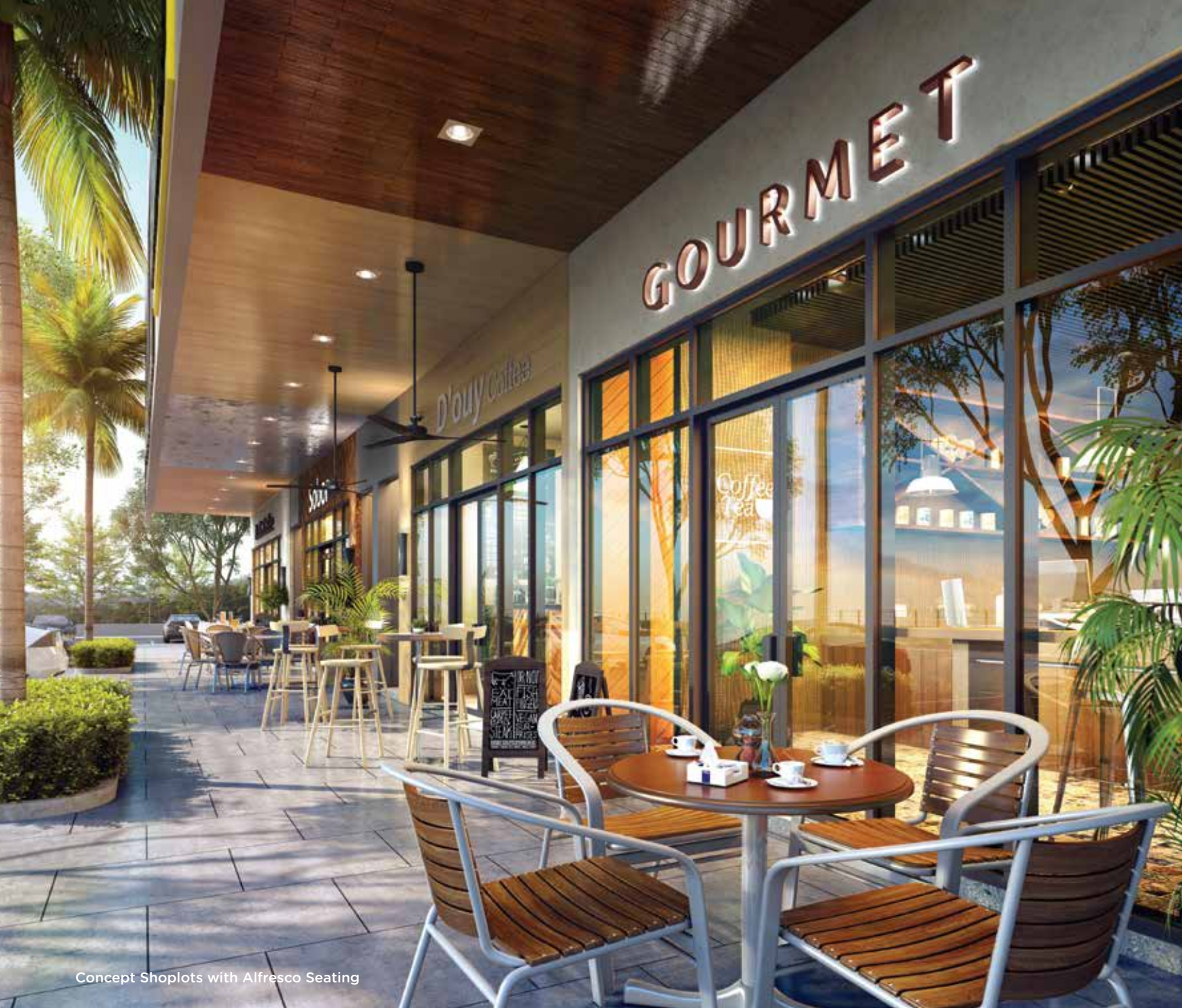
Concept Shoplots with Alfresco Seating