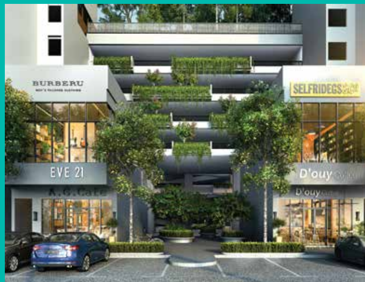
Retail Shoplots Drop-off

Maya Bay Retail Shoplots are also attractive to many residents and visitors owing to the retail zone's walkability and bike friendliness, that gives it a great vibe that encourages communal exploration of the spaces and brings in a mix of people to relax and chill out.