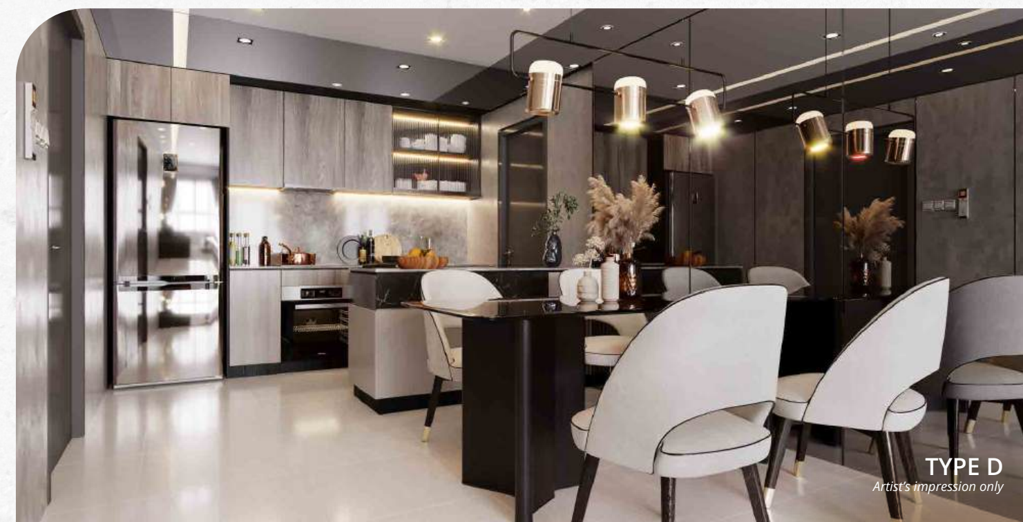
TYPE D Artist's impression only

Contemporary dynamic layouts ranging from 2-3 bedrooms that cater to your personalized lifestyle. Some units includes Dual Key feature, perfect for extra family privacy or an additional room for an investor's rental.