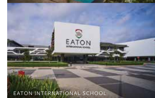
EATON INTERNATIONAL SCHOOL