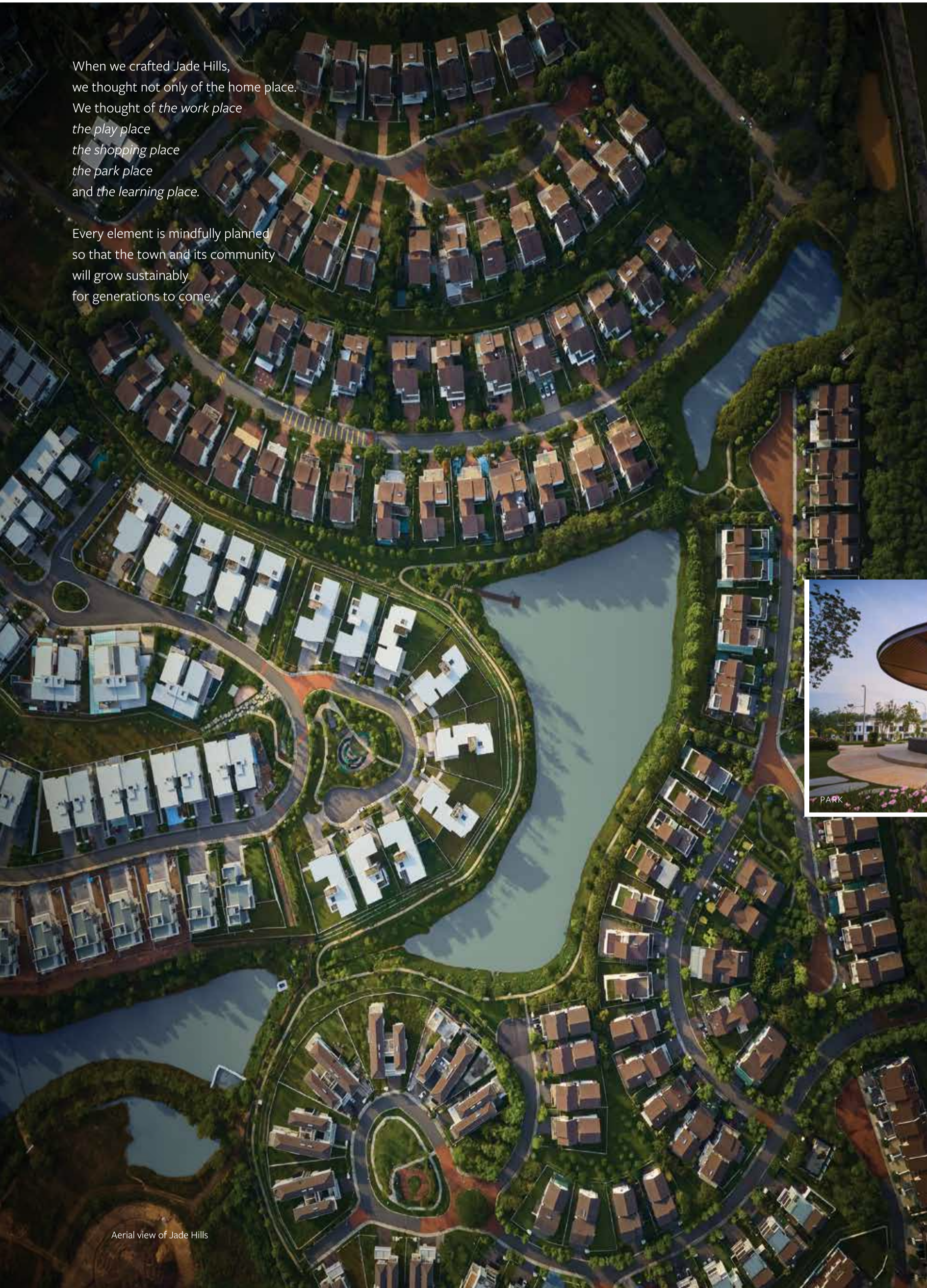
Aerial view of Jade Hills

Every element is mindfully planned so that the town and its community will grow sustainably for generations to come.